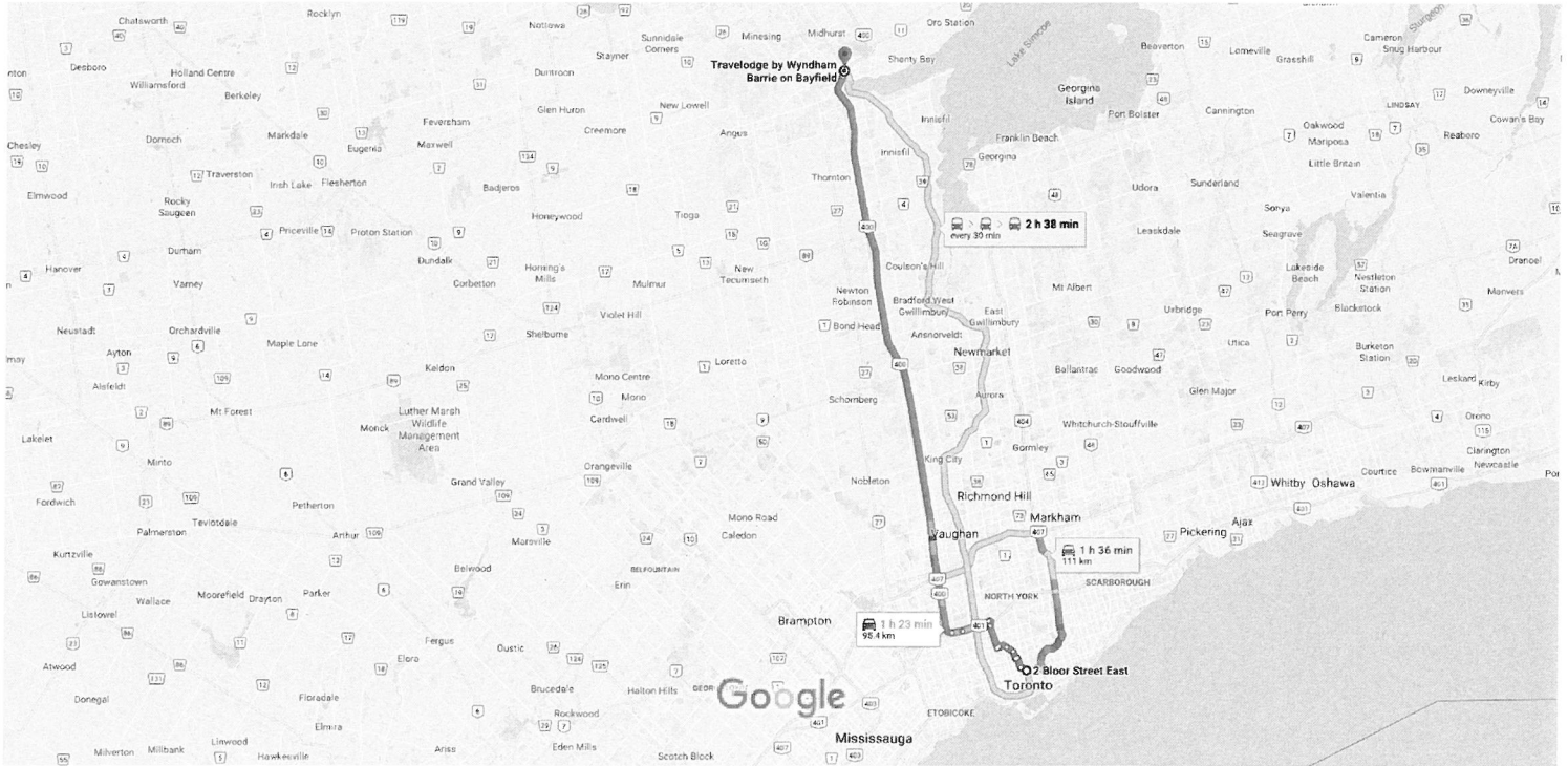
Map data ©2018 Google 10 km